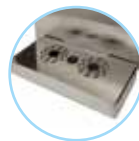
B1. Basic Tray

Adaptor H3/4" - Stem 8 mm. Elbow 8 mm. Adaptor M3/8" - 8 mm. 2 m tube 8 mm. *Pressure reducer CO 2 .