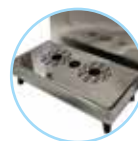
B2. Tray with drain